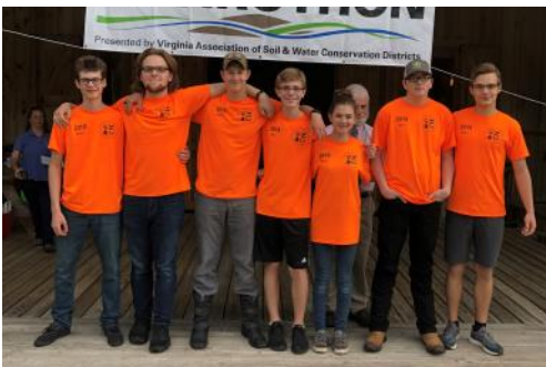
Buckingham CHS Envirothon Team

Two teams participated in the Area V Envirothon for 2019 competition year.