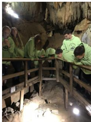
Picture on left: Swinging bridge over the Cow Pasture River; Picture on right: Natural Bridge Caverns

The camps are an extension of the school MWEE (Meaningful Watershed Education Experience) program that is conducted all year long with 6 th graders in Buckingham and Cumberland Counties. The trips allow students to see how we impact water downstream on out to the Chesapeake Bay. The Headwaters shows them where it all starts.