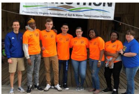
Cumberland CHS Envirothon Team