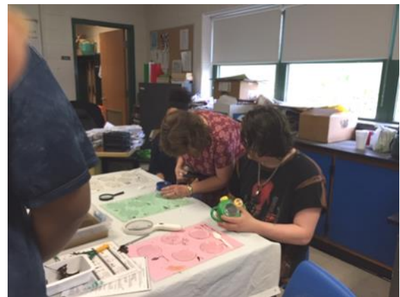
Ecology classes studying macroinvertebrates at Buckingham High School