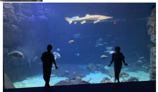
Bottom Picture: Group toured the Virginia Aquarium & Marine Science Center, Virginia Beach Program: Marine Mysteries