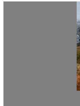
Completed SL-6 Stream Exclusion with Grazing Land Pump house

Total Cost-Share Paid Out:.....$43,282.42 Total Tax Credit on Out-of-Pocket.....$51,161.84