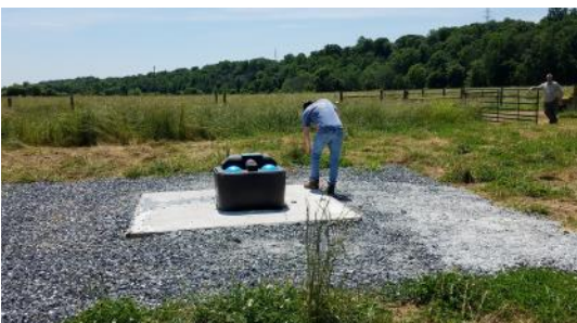
Completed SL-6 Stream Exclusion with Grazing Land

Total Cost-Share Paid Out:.....$78,260.14 Total Tax Credit on Out-of-Pocket.....$5,034.80