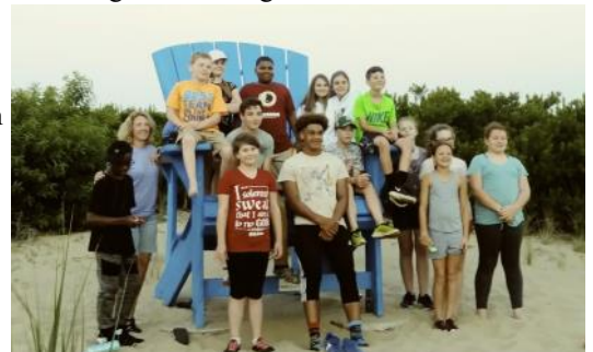
Top Picture: Group experienced a day at Little Island State Park, Virginia Beach near Sandbridge. 1/3 of this group experienced the Atlantic Ocean for the first time