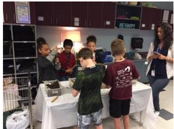
Soils study with Cumberland 3rd graders