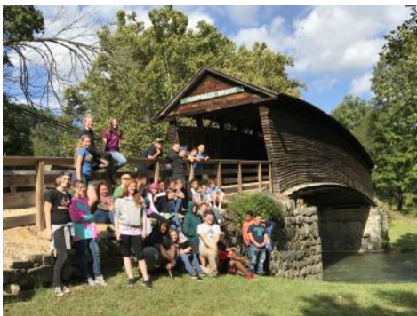
Picture above: Students in front of Humpback bridge, Covington VA, along their travels observing the Jackson River and traveling to Falling Springs Waterfall

The camps are an extension of the school MWEE (Meaningful Watershed Education Experience) program that is conducted all year long with 6 th graders in Buckingham and Cumberland Counties. The trips allow students to see how we impact water downstream on out to the Chesapeake Bay. The Headwaters shows them where it all starts.