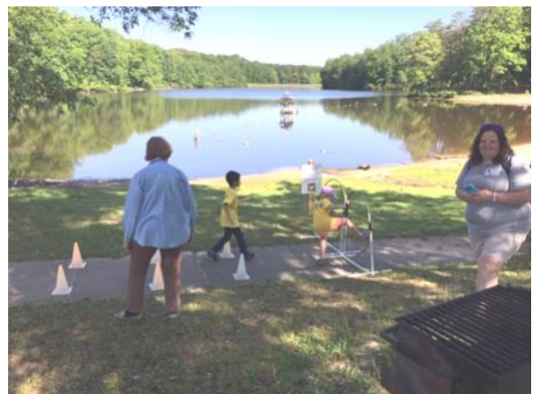
Leap frog relay with Cumberland 1st Graders at Bear Creek Lake